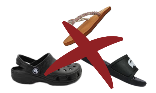
NO Crocs, sandals, slides, shower shoes, or flip-flops