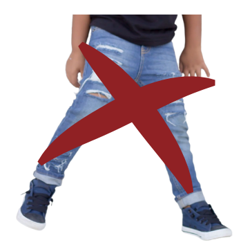
NO ripped, frayed, or torn jeans